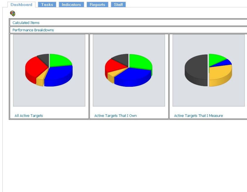
Figure 1: Default dashboard configuration

Users can customise the information that is displayed on the dashboard by clicking on the artists palette icon on the top left of the dashboard, this will open the customise dashboard display page.