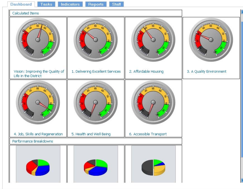
Figure 4: Small gauges showing a number of strategy map items along with pie charts